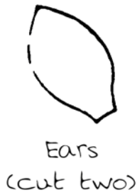
Ears (cut two)